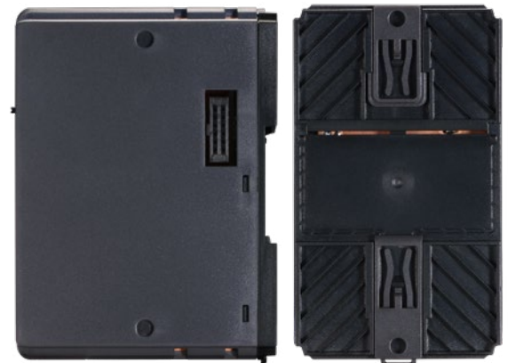
Shown here are the front and back of the iR-ETN40R. Notice the molded channel to allow DIN-rail mounting.

Exclusive feature — quick generation of description files: Engineers can use Weintek EasyRemoteIO software to connect to an iR-ETN40R being programmed and then generate a description file needed for I/O configuration. These files can then be quickly imported by other software to complete configuration with ease. EasyRemoteIO software can generate files for EasyBuilder Pro HMI programming as well as PLCopen eXtensible Markup Language XML files and EDS files for EtherNet/IP scanner devices.