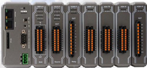
(I/O modules not included)